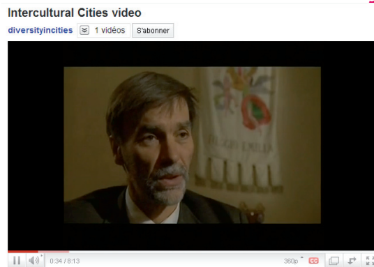
The Intercultural cities video on YouTube

The intercultural city has people of different nationalities, ethnic origin, language or faith who share a feeling of belonging to the local community. Diversity is central to the city identity and this is reflected in the official discourse. Public policies deal with diversity as a resource for development; institutions are culturally competent and representative of the diverse citizenry. The city actively promotes human rights, combats discrimination and adapts its governance and services to the needs of a diverse population. The city has a strategy and tools to deal with cultural conflict. It encourages mixing and interaction between diverse groups in the public space in order to foster cohesion and realise the diversity advantage.