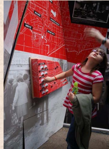
open air events